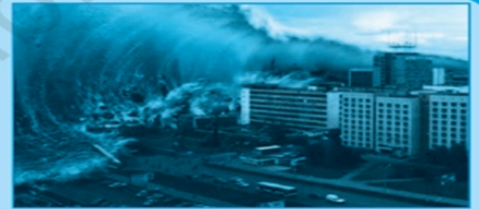
Tsunamis can be caused by earthquakes, volcanoes, landslides, or meteorites.

As the wave approaches the beach, it slows, builds in height and crashes on shore